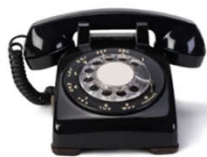
Conventional School Model